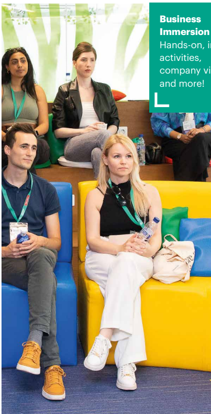
Business Immersion Week Hands-on, interactive activities, company visits and more!